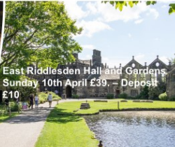
East Riddlesden Hall and Gardens Sunday 10th April £39 - Deposit £10