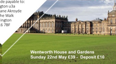
Wentworth House and Gardens Sunday 22nd May £39 - Deposit £10