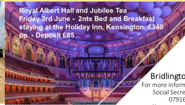
Royal Albert Hall and Jubilee Tea Friday 3rd June - 2nts Bed and Breakfast staying at the Holiday Inn, Kensington. £340 pp - Deposit £65