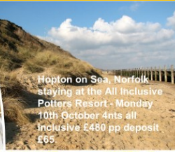
Hopton on Sea, Norfolk staying at the All Inclusive Potters Resort - Monday 10th October 4nts all inclusive £480 pp deposit £65