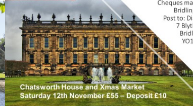
Chatsworth House and Xmas Market Saturday 12th November £55 - Deposit £10