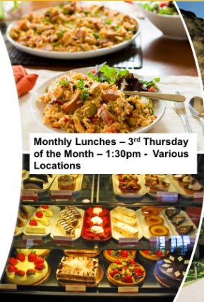
Monthly Lunches – 3 rd Thursday of the Month – 1:30pm - Various Locations

Post to: Diane Akroyde 7 Blythe Walk Bridlington YO16 7BF