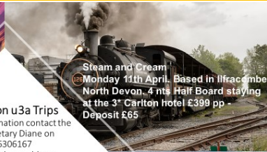
Steam and Cream Monday 11th April. Based in Ilfracombe North Devon. 4 nts Half Board staying at the 3 rd Carlton hotel £399 pp - Deposit £65